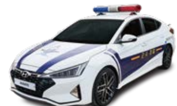
AVANTE_Navy Patrol Car