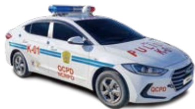
AVANTE_Philippine Patrol Car