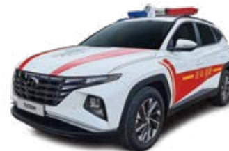
TUCSON_Marine Corps Patrol Car