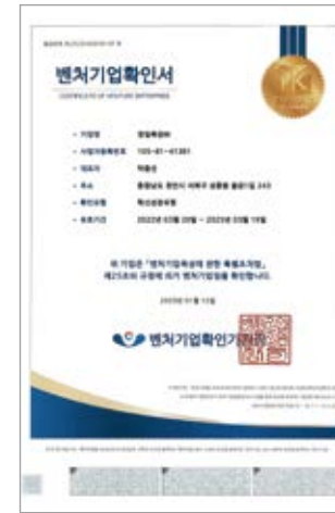
Venture business confirmation