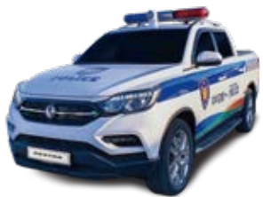
REXTON_Jeju Patrol Car