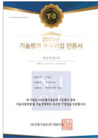
Certificate of Excellent Technology Evaluation Company