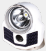
Multicam (Search Integrated)