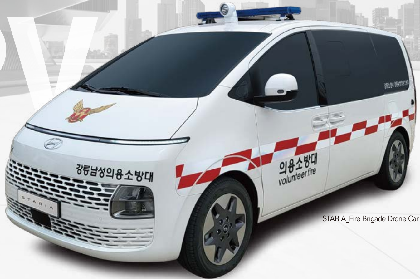
STARIA_Fire Brigade Drone Car

Using the wide structure of the vans that are nine-seaters or larger, we produce a variety of special equipment for special purposes.