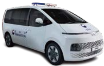
STARIA_Immigration Escort Van