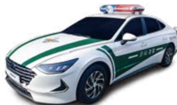
SONATA_Army Patrol Car