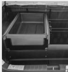
Equipment Box [ Patrol Car ]

We can custom-make various equipment and items to suit the vehicle and storage purpose, enabling safe and convenient loading and storage.