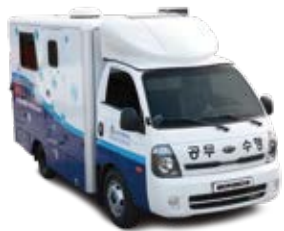
BONGO_Mobile Bath Truck

We produce trucks and box trucks to provide services for operational team members regardless of environment, condition, or location.