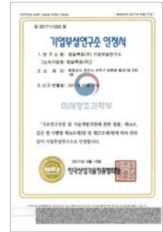
Corporate Research Institute Authorization Certificate