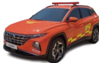
TUCSON_Fire Patrol Car