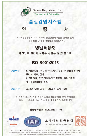
Quality Management System Certificate