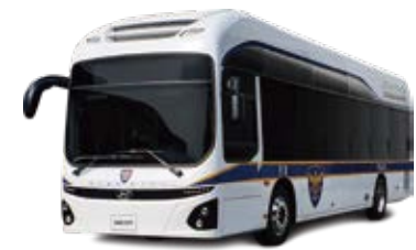
ELEC CITY_Convoy Bus (Hydrogen Electric Transport Bus)