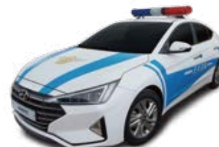
AVANTE_Air Force Patrol Car