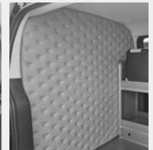
Safety Partition [ Canine Transport Vehicle ]