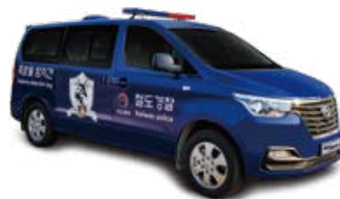
STAREX_Canine Transport Vehicle