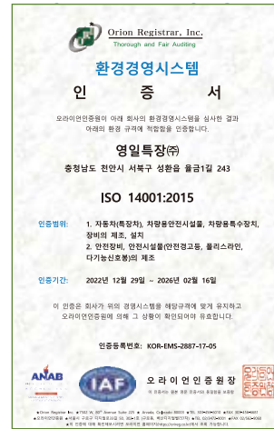
Environmental Management System Certificate