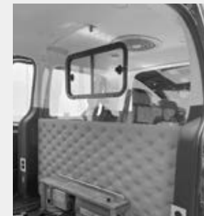
Safety Partition [ Canine Transport Vehicle ]

We make the equipment sturdy using durable materials such as polycarbonate, and equipment that can prevent escape and separate spaces.