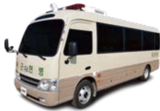
COUNTY_Investigation and Forensic Command Bus