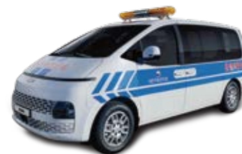
STARIA_Speed Control Car