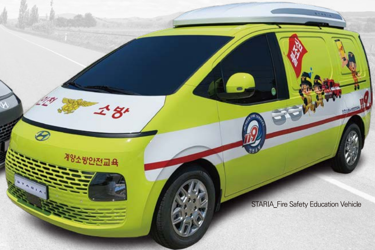
STARIA_Fire Safety Education Vehicle