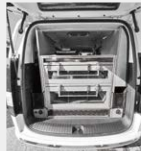
Equipment Box [ Forensic Investigation Vehicle ]