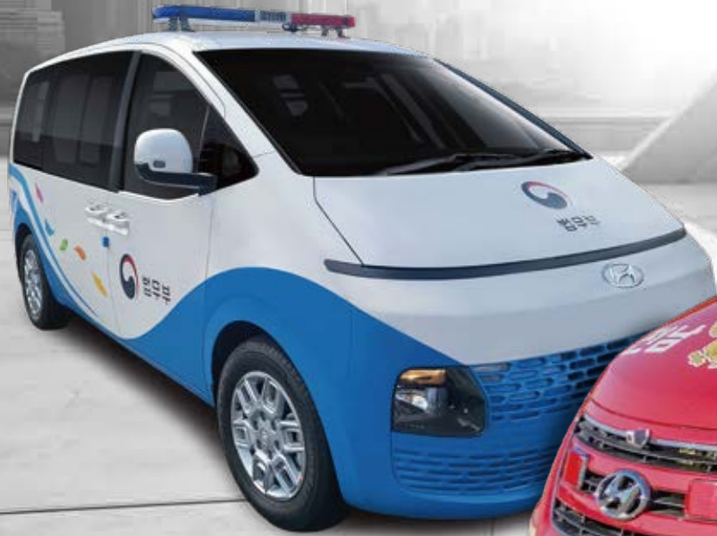
STARIA_Juvenile Reformatory Escort Van