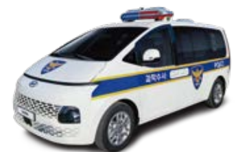
STAREX_Forensic Investigation Vehicle