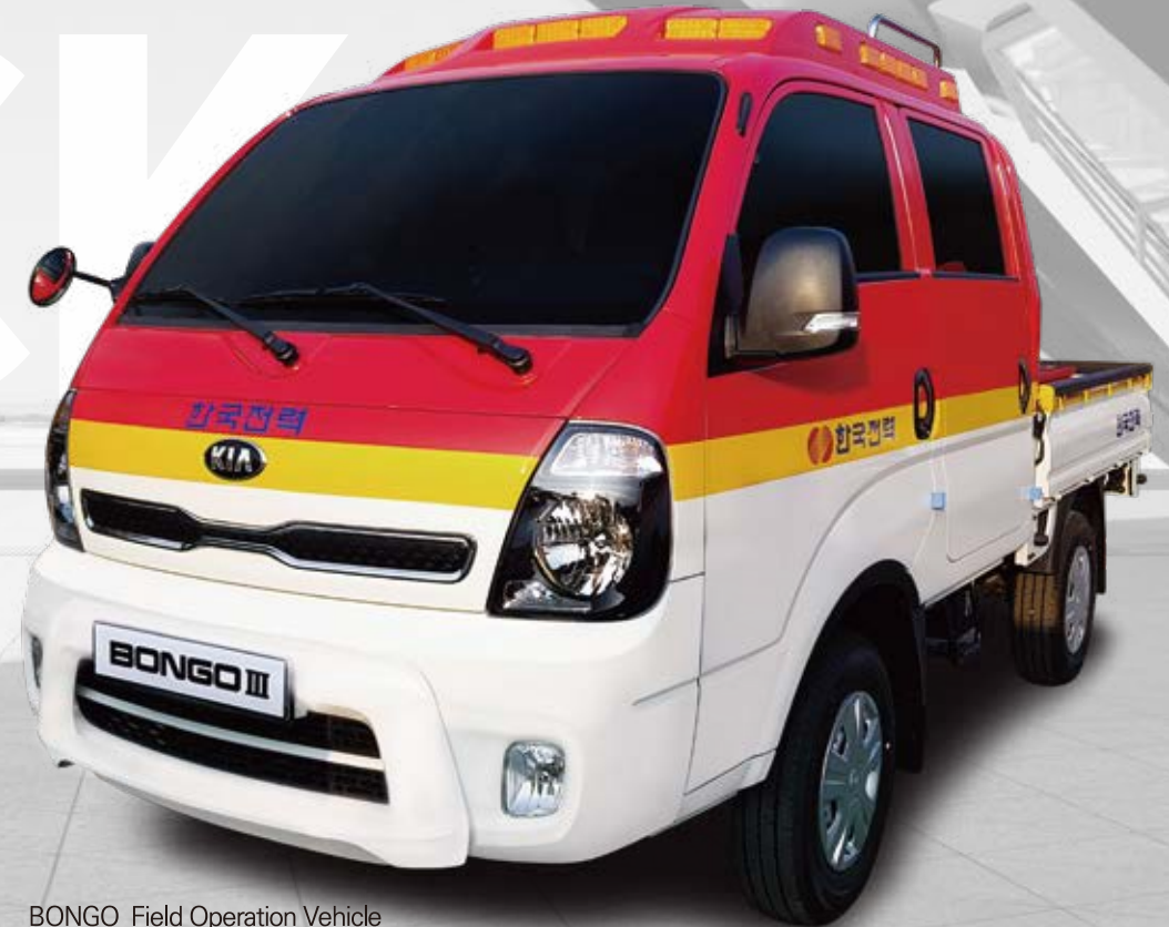
BONGO_Field Operation Vehicle